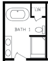
RO-9 Opt. Master Bath w/Freestanding Tub