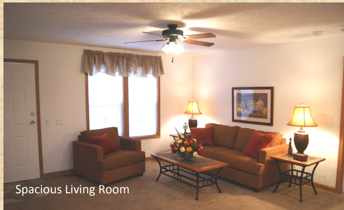
Spacious Living Room