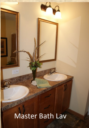
Master Bath Lav