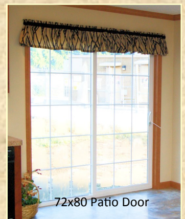
72x80 Patio Door