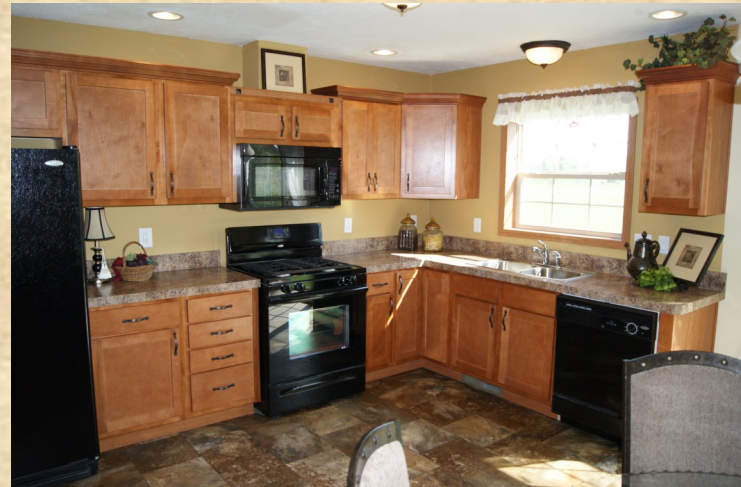
Optional Kitchen: Milan Shaker Hardwood Cabinetry - 30" Overhead Cabinets - Recessed Can Lights - Black Whirlpool Appliances (18 CF refrigerator, 30" Gas Range, Microwave & Dishwasher)