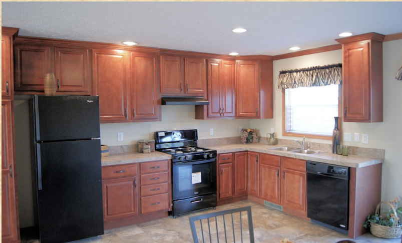
Optional Kitchen: Virginia Shaker Hardwood Cabinetry - 40" Overhead Cabinets - Recessed Can Lights - Black Whirlpool Appliances (18 CF refrigerator, 30" Gas Range, Dishwasher)