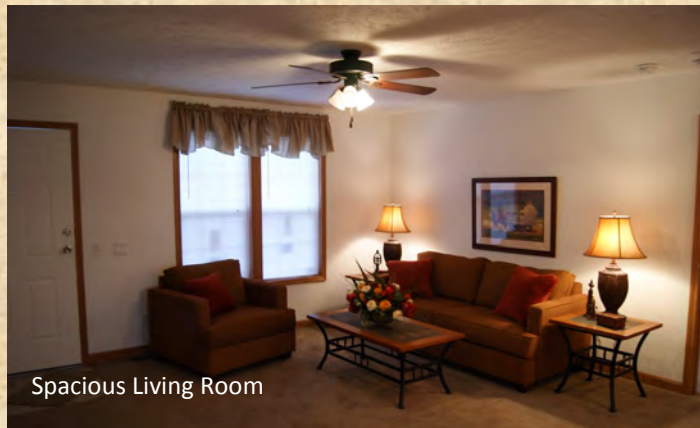
Spacious Living Room