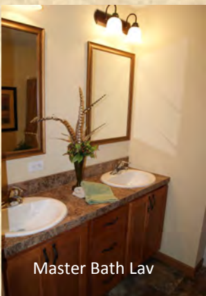
Master Bath Lav