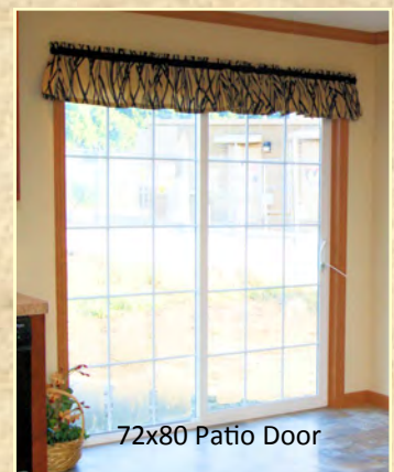
72x80 Patio Door