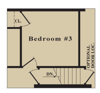
OPTIONAL BASEMENT STAIRWAY LOCATION